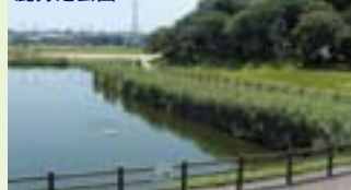
Besso Pond Park (Besso ike koen) 別普池公園 MAP J-3